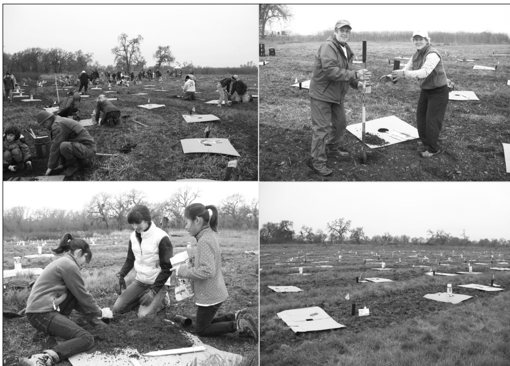
Tree planting photos from our First Annual Tree-A-Thon.