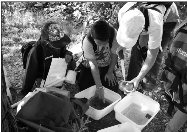
Learning Laguna students learning about aquatic food webs.