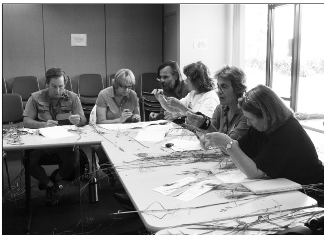
Laguna docents studying grasses in a continuing education class.

Over the 10-week program we explore the wonders of the Laguna, both indoors and out, including visits to special places not open to the public. You will read interesting and stimulating articles, learn about the Laguna ecosystems and its natural and cultural history, interact with the engaging and dynamic Learning Laguna activities, all the while having fun and bonding with fellow trainees and the entire docent circle.