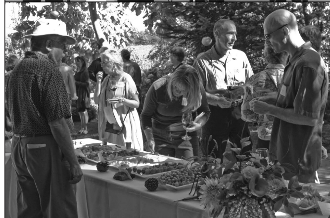
Food, wine, entertainment and auction at the Gala.